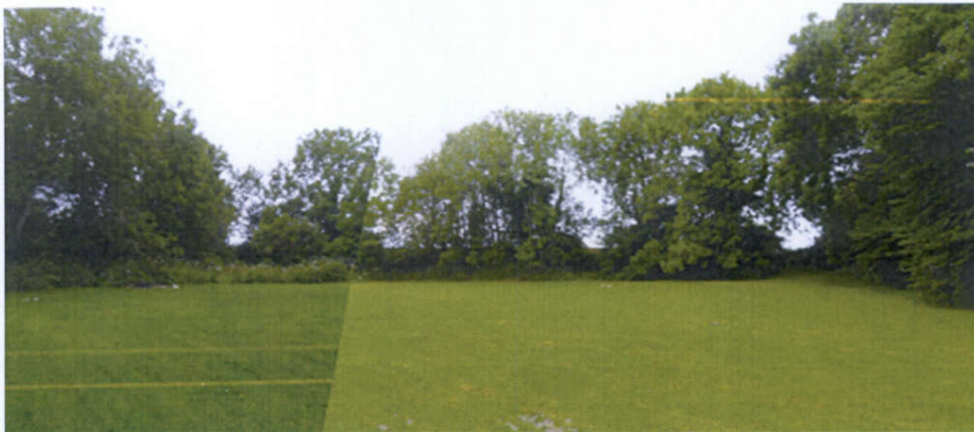
View from the camp site field, looking south, showing the tree lined boundary.