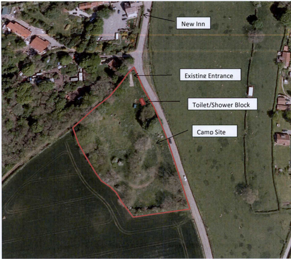
Google Earth View –Proposed Camp Site, New Inn, Cropton.