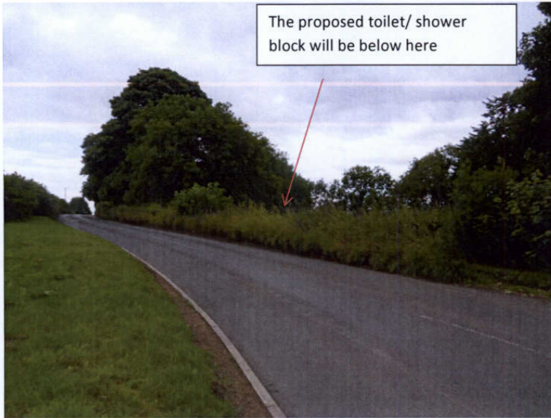
View on Cropton Lane looking south.